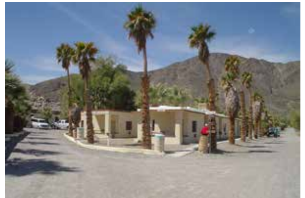
ZZYCOTT Cottages Rooms for Two