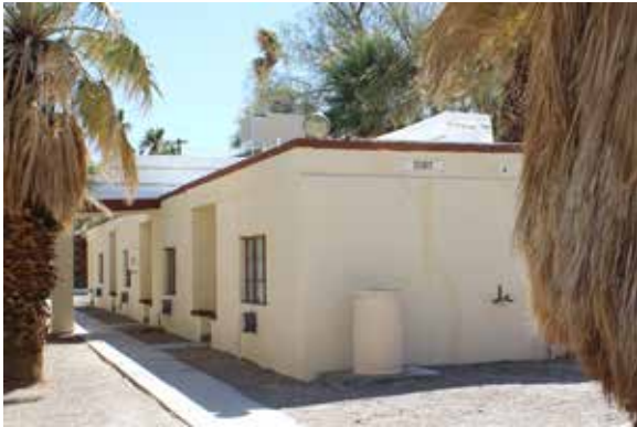
ZZYCOTT Cottages Rooms for Two