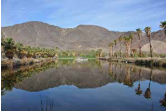
Lake Tuendae Home of the Mojave Chub