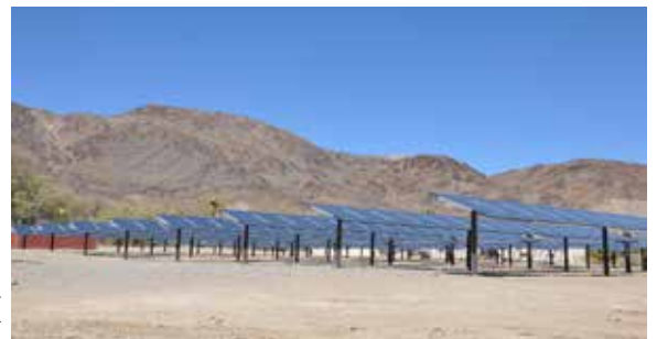
ZZYZX - Powered by Solar Panels and Batteries with Generator Back-up

To See More Camp ZZYZX Pictures click here!