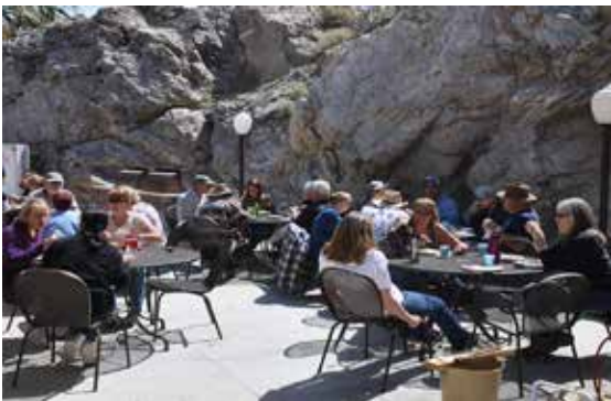
Camp ZZYZX - Fresh Air Dining