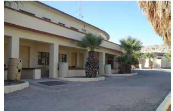
The Castle - Couples rooms on the bottom - Dorm Room upstairs