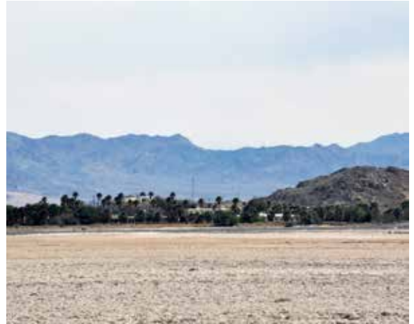
First View of Camp ZZYZX from ZZYZX Road