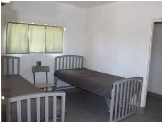
ZZYCOTT Cottages Rooms for Two