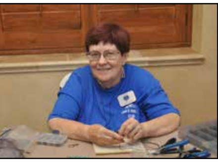
of Beading at the Fair