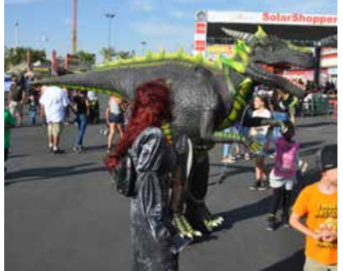
Dragons were seen roaming the Fair Grounds