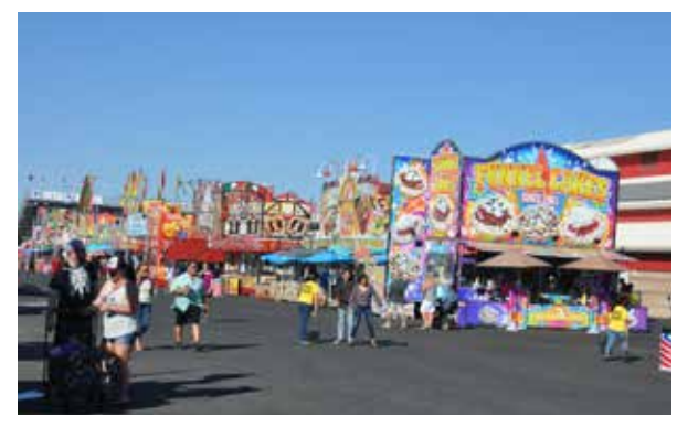
Midway at the Fair - Fair Food for all